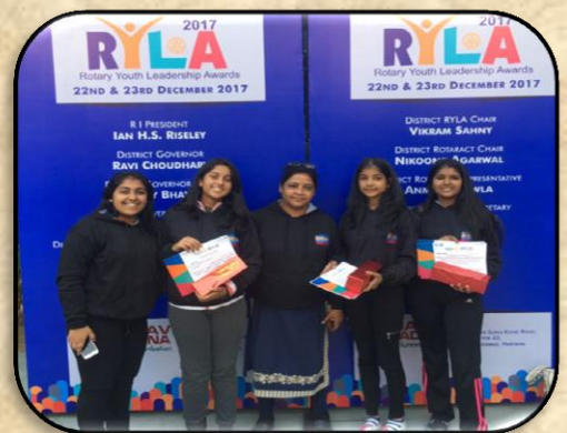
Students with the Annual Rotary Leadership awards