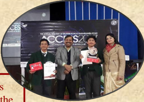
Students receiving the award

The two days of challenging competition, nerve wrecking quizzing and astounding feats of knowledge proved that 'Access 2017' was not just a symposium but a festival of skill, paving a path to the future.