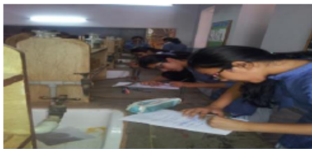
Students recording results