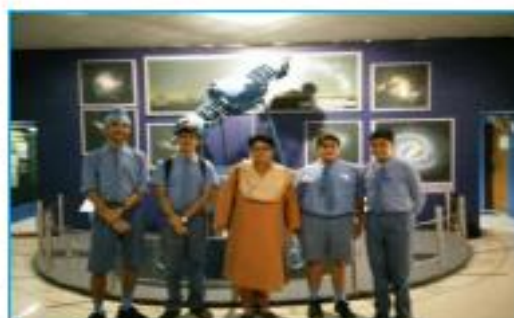
Students at the planetarium