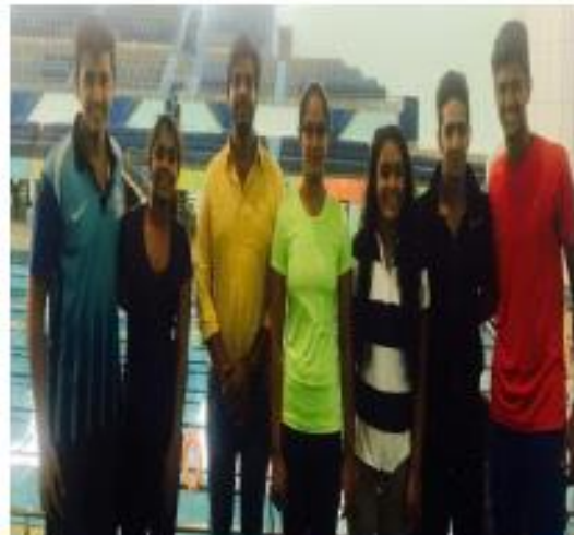
Modernites at the swimming championship