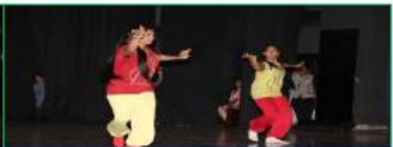
Dance by Students