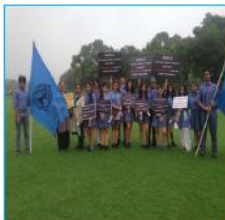
Modernites ready to move on a walk for a cause