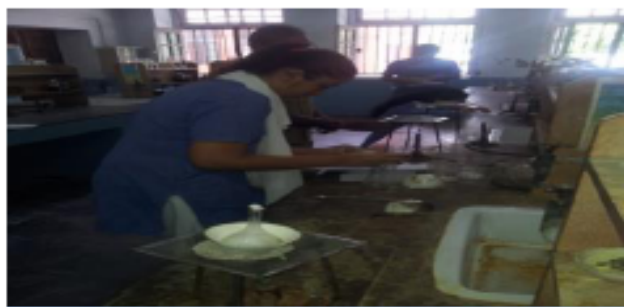
Students performing experiments

Students of S4 took the practical examination for the first time as a part of their half yearly evaluation. The practicals were conducted in physics, chemistry and biology. The students were examined for their skill to use the apparatus, to do experiments on their own, to use a microscope and to record results from the equipments in the laboratory. It developed in them a scientific aptitude. Hands on learning increases their understanding of the subjects and helps them to learn those things which they had been learning theoretically. The science teachers also carried out a viva thus preparing them for the board exams in the future. It was a great experience for the students and they were very excited and enthusiastic during the examination.