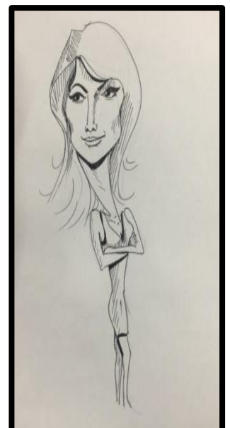
Some caricatures drawn at the workshop.