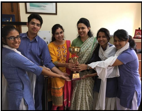
Winners of Symphenia, Comfest

THE ROLLING TROPHY WAS AWARDED TO MODERN SCHOOL.