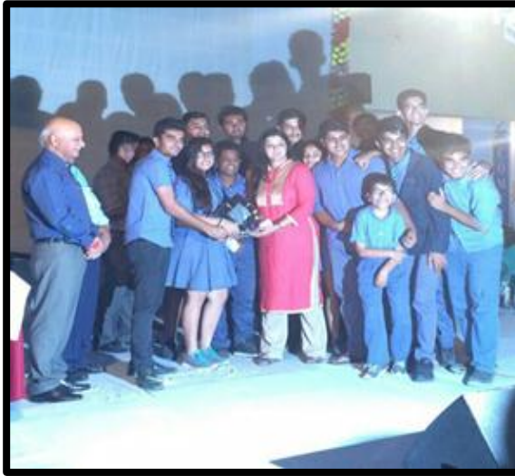
Winners of COMFEST- Computer festival