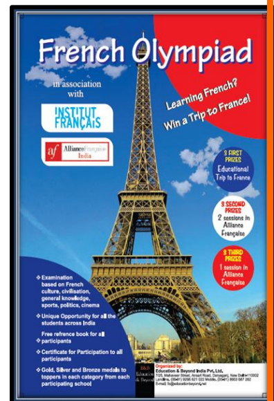
French Olympiad Poster