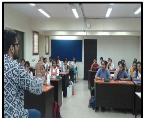
The students at the workshop