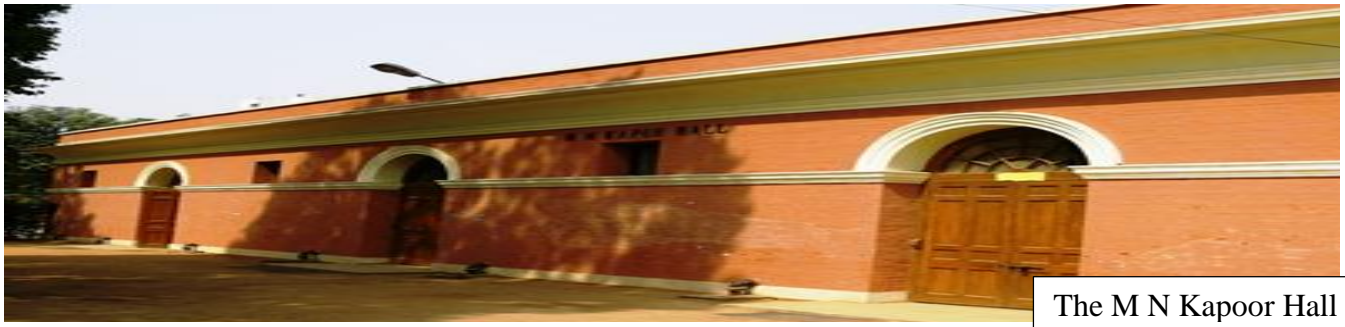
The M N Kapoor Hall