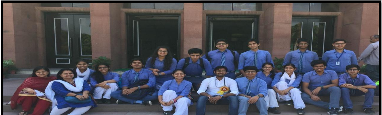
Students at the N.P.L visit