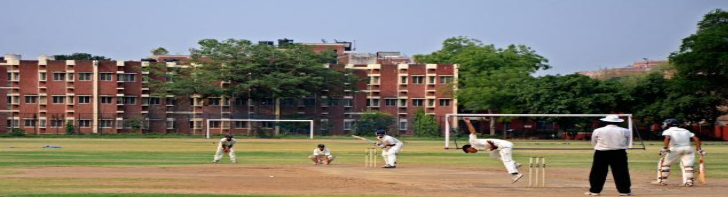
Hostel overlooking the Cricket Field