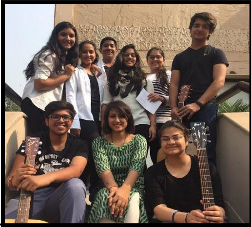
STUDENTS OF MODERN SCHOOL AT THE FRENCH FESTIVAL

The Annual Inter School French Festival was held on Saturday, 21st