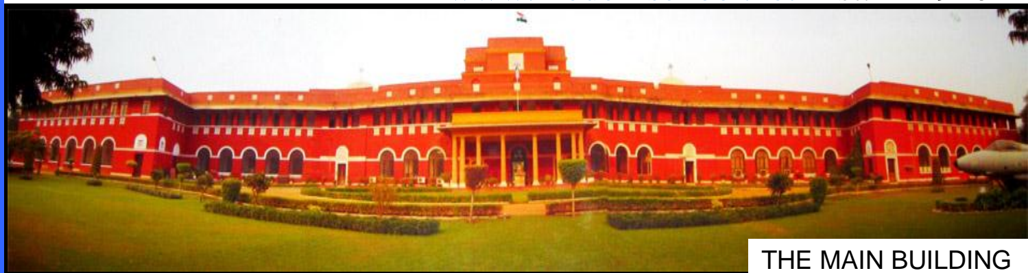
THE MAIN BUILDING