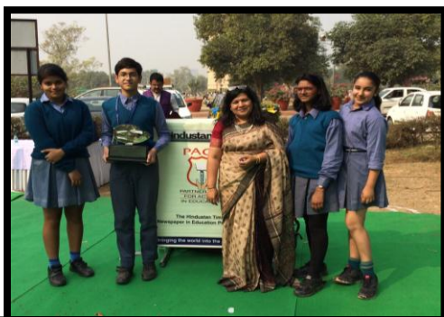
STUDENTS AT THE ART COMPETITION