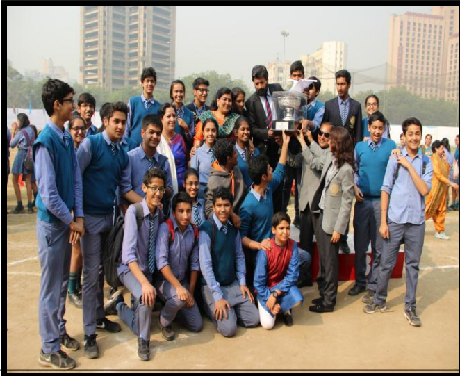
LAXMIBAI HOUSE WITH THE MARCH PAST TROPHY

After the prize distribution ceremony, the 'Principal' gave a short speech highlighting the importance of sports. Students were encouraged to engage in sports and outdoor