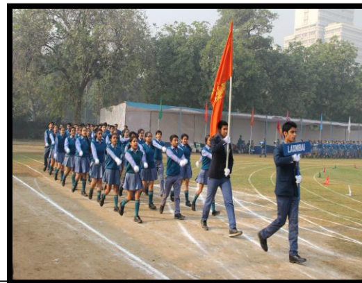
LAXMIBAI HOUSE DURING THE MARCH PAST