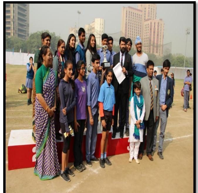
GANDHI HOUSE WITH THE SPORTS TROPHY