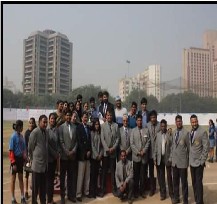
MODERN SCHOOL SPORTS DEPARTMENT

games on a regular basis. Participating in various games and sports develops a feeling of sportsman spirit. In sports, the participating candidates may win or lose, but students learn to accept both victories and defeat with grace. Life is also just like a game. Moreover, sometimes you win, and sometimes you lose. Sports helps to improve our physical and mental strength. Our body remains fit and healthy. Sports day would not have been complete without the Karamchari race and the parents race.