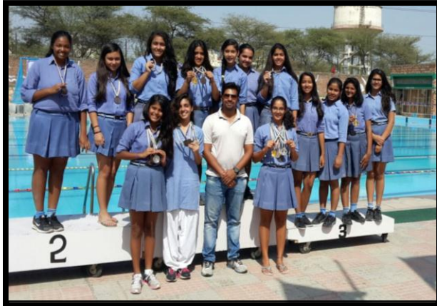
THE GIRLS TEAM WITH THEIR MEDALS

Scoring a total 21 medals. The individual result:-