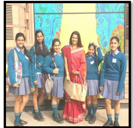
STUDENTS AT THE VASANT VALLEY SCIENCE FESTIVAL