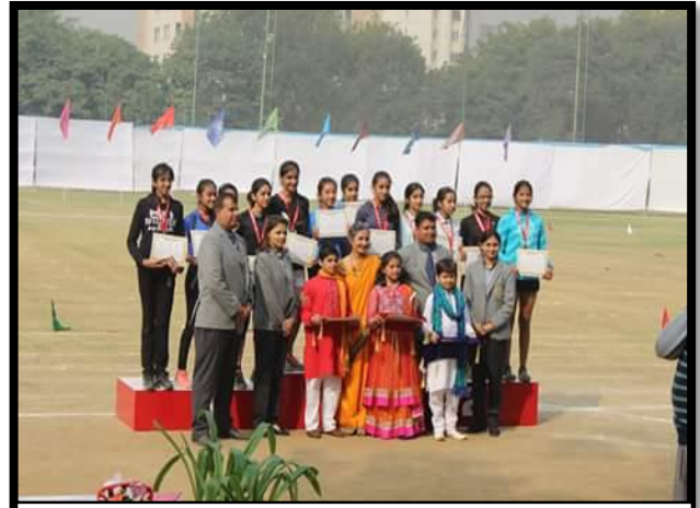
THE PRIZE DISTRIBUTION CEREMONY

games on a regular basis. Participating in various games and sports develops a feeling of sportsman spirit. In sports, the participating candidates may win or lose, but students learn to accept both victories and defeat with grace. Life is also just like a game. Moreover, sometimes you win, and sometimes you lose. Sports helps to improve our physical and mental strength. Our body remains fit and healthy. Sports day would not have been complete without the Karamchari race and the parents race.