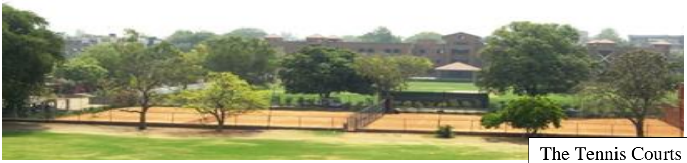
The Tennis Courts