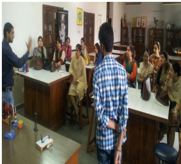
Science teachers at the workshop