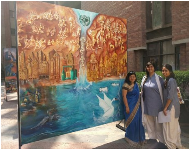
A PAINTING BY MODERNITES FOR UNIC

This year, the United Nations Information Centre organized an exhibition, where it used visual art as a medium to communicate the message of Clean Water and Sanitation to the wider public. Modern School was among the seventeen schools selected in India to express their creative vision on sustainable development by painting an 8 Feet x 8 Feet canvas that illustrated the core message of the goal. These canvases were displayed at the India Habitat Centre in the month of March and were also appreciated on social media.