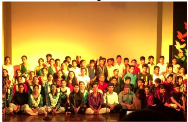
The House Song