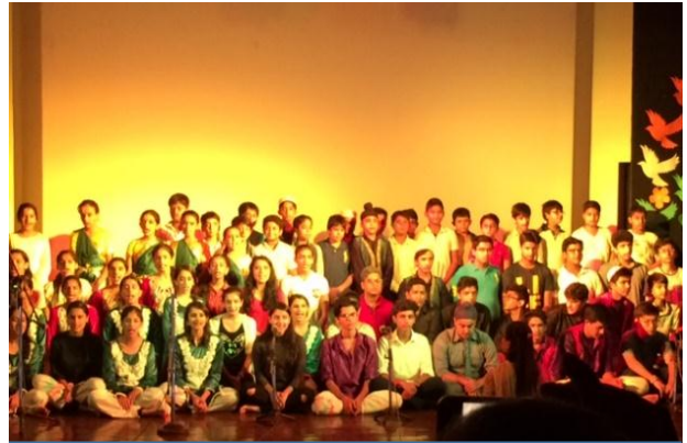
The House Song