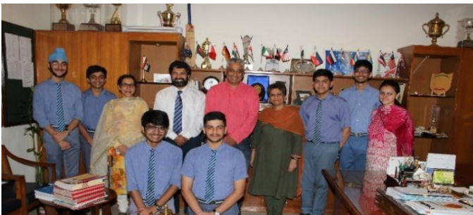
Rajdeep Sardesai with the Principal and Quiz Club Team

As he stepped aboard the bus, thundering applause greeted him warmly. MSB engines ignited, cameras started rolling and excitement levels reached sky high. When Mr. Sardesai picked up his microphone, interactive, humble and witty, he instantly struck a chord with the young audience. He proceeded to ask quiz questions to the children and everyone answered with utmost zeal and commendable accuracy. "Where did the latest ISRO PSLV Launch take place?" he asked. With a number of excited hands going up to answer him he was impressed by the awareness of the young lot. Being a quizzier himself, he also invited children to ask him questions. In the short bus journey with him through iconic Delhi landmarks, everyone was left enriched.