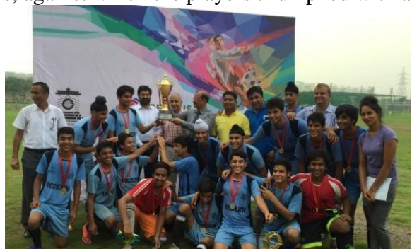
The Proud Winners of the Football Tournament