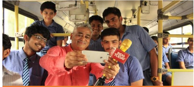
The eager students taking a selfie with the Quizmaster

As Rajdeep Sardesai bid adieu, children were ecstatic about the unique experience of travelling with a celebrity. Eager to witness the New Wiz on India Today, on Sunday at 11 AM and cheer for their school, the children went home to share their exciting experience with their parents.