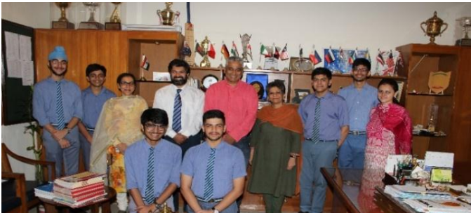
Rajdeep Sardesai with the Principal and Quiz Club Team

As he stepped aboard the bus, thundering applause greeted him warmly. MSB engines ignited, cameras started rolling and excitement levels reached sky high. When Mr. Sardesai picked up his microphone, interactive, humble and witty, he instantly struck a chord with the young audience. He proceeded to ask quiz questions to the children and everyone answered with utmost zeal and commendable accuracy. "Where did the latest ISRO PSLV Launch take place?" he asked. With a number of excited hands going up to answer him he was impressed by the awareness of the young lot. Being a quizzier himself, he also invited children to ask him questions. In the short bus journey with him through iconic Delhi landmarks, everyone was left enriched.