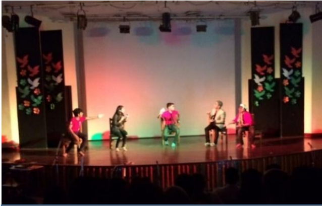
The Skit on Advertisements

On the 14 th of July, there was much excitement among the students of Subhash House. This was because it was their Biennial house function. Both the teachers and the students had put a lot of hard work into this and everyone was hoping that the event would be a huge success. And it was!