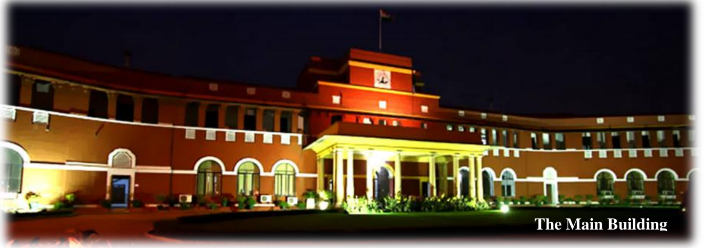
The Main Building