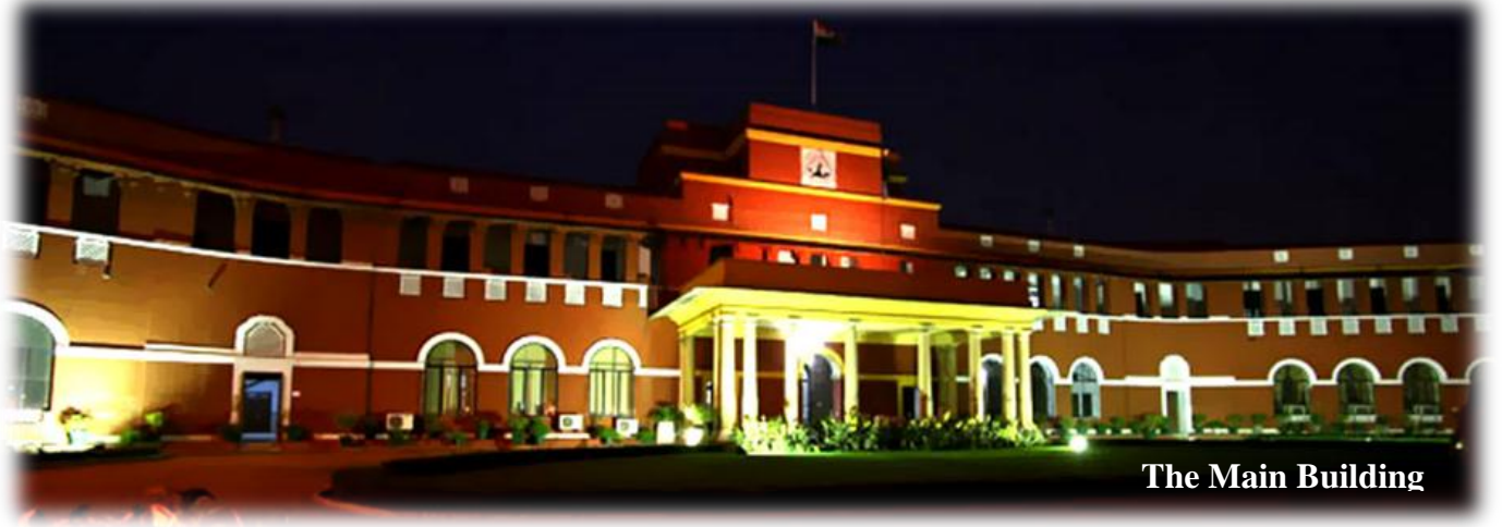
The Main Building