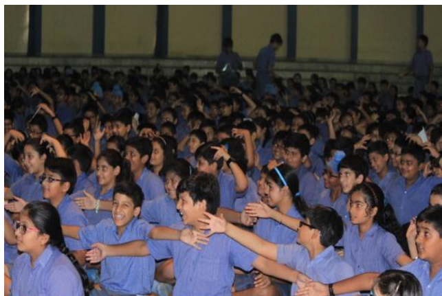
Open to Learning - Middle School

He conducted a variety of mind teasing exercises and exposed the eager children to innovative ways to enrich their personality. He also focussed on developing innovation and experimentation aspect among