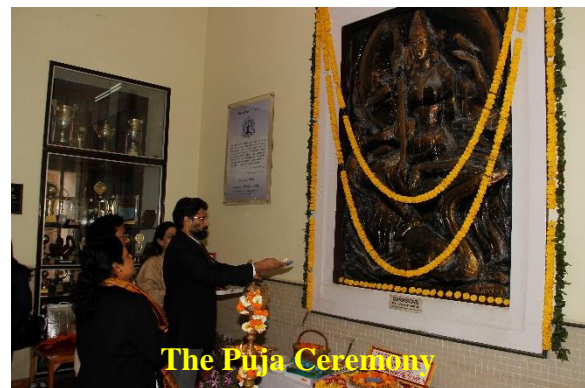
The Puja Ceremony

Basant Panchami marks the beginning of spring and falls on the fifth day of 'Maagh' each year. According to a popular belief, Goddess Saraswati was born on this day and people celebrate the festival by worshipping the Goddess of Learning, Knowledge, Music and Culture. The students and teachers of Modern School Barakhamba Road