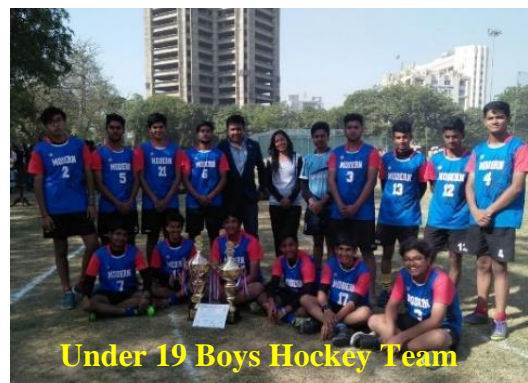
Under 19 Boys Hockey Team

Under 19 Boys XIII Modernites Invitation Hockey Tournament 2016 for Rishabjeet Singh Mason Trophy was held at Modern School Barakhamba Road from 21 st to 25 th November 2016. Modern School bagged the Runner Up Trophy.