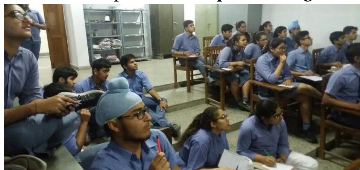
S6 and S7 students being prepped about the test

'Arthgaurvam' – the Economics Society conducted various activities under the guidance of the Economics Department. A quiz was organised for the students of classes S6 and S7 on 12 th