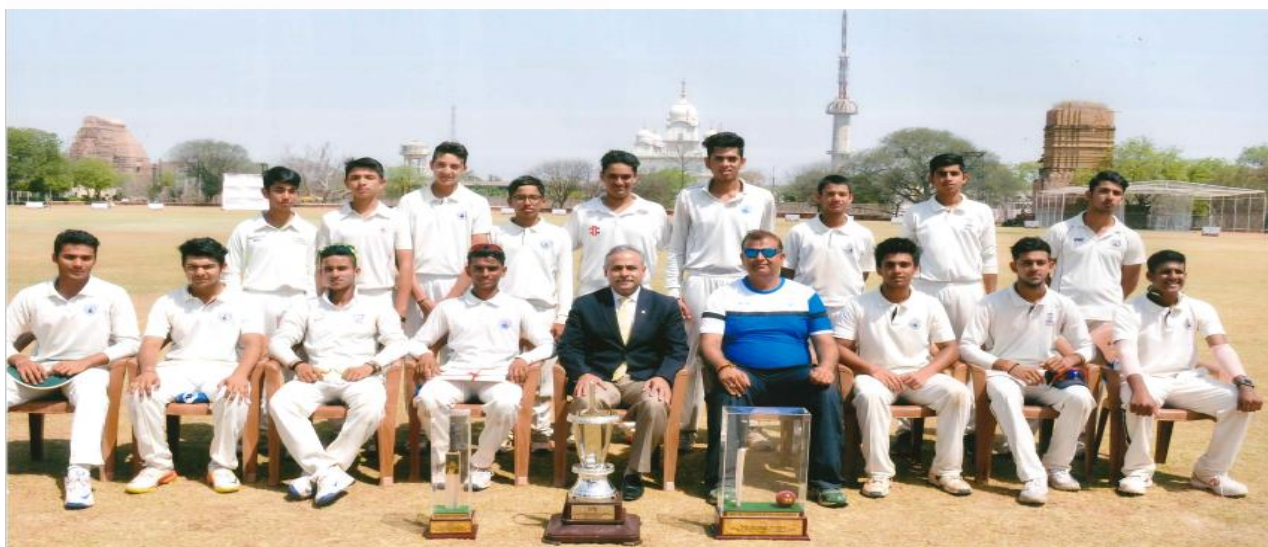
The U-19 Cricket Team at the 15 th H. H. Maharaja Madhavrao Scindia Memorial Cricket Tournament