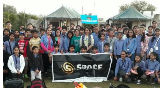
Students just before an overnight session

They identified the stars on the basis of their brightness and learnt how to use the Plano sphere, to know on which day and at what time the constellation could be seen. They set up their own telescopes and witnessed a mesmerizing view of Jupiter, its ring and its four most visible moons, and also caught a beautiful glimpse of the planet Saturn! They were briefed about the DSLR cameras and then were asked to click pictures of various constellations and planets that could be seen using these Cameras.