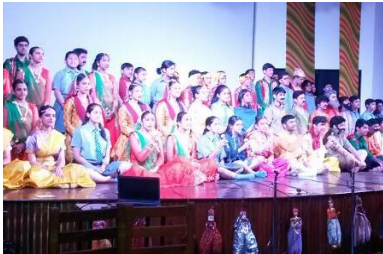
Laxmibai members singing the House Song