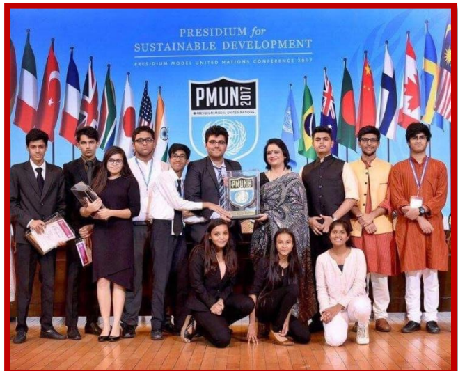
MUN students receiving their awards