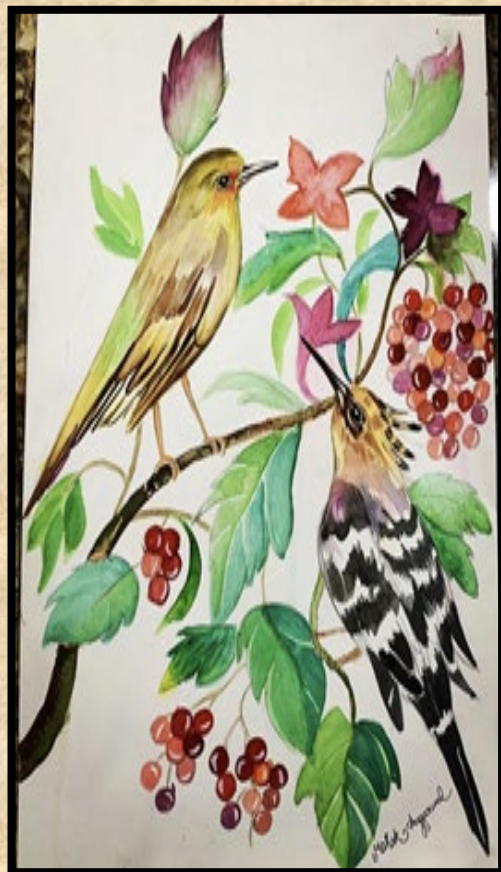
CREATIVE ART WORK BY MAHAK AGGARWAL (S6J)