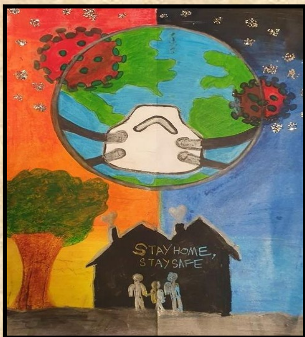
SAHAS PURUSWANI (S6J)