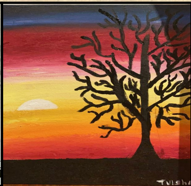
CREATIVE ART WORK BY TVISHA GUPTA (SIC)