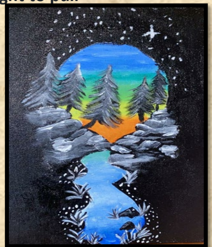
CREATIVE ART WORK BY TVISHA GUPTA (S1C)

Small bits of enjoyment can also be found in twinkling stars, Watching moon soothes my heart with disturbance of less cars Mix emotions always arise in my mind This unique stance is very difficult to find.