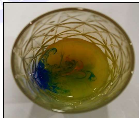
AWARD WINNING PHOTOGRAPH