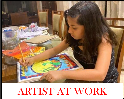
ARTIST AT WORK

where they learnt various nuances of gourmet cooking which included something as simple as a lemonade and as classy as a biscuit pudding and cheese toast. On the other hand, students had a great time attending Fine Arts workshop where they tried their hands at spray painting and Madhubani painting. They also enjoyed learning old newspaper drawing, poster colour drawing, pencil