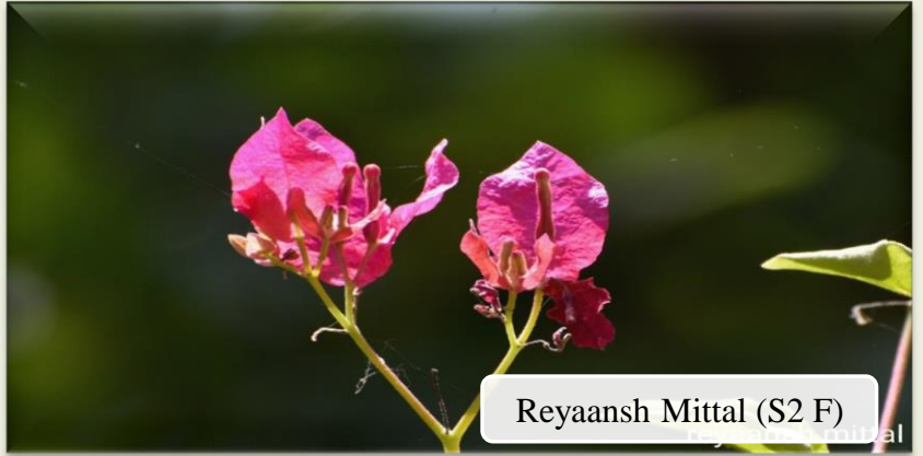
Reyaansh Mittal (S2 F)