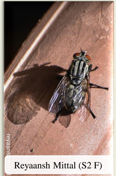
Reyaansh Mittal (S2 F)