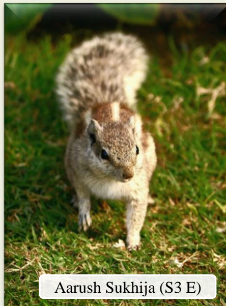
Aarush Sukhija (S3 E)