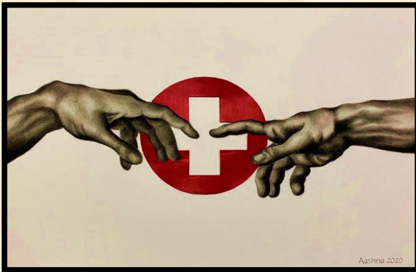
Saving lives in COVID times

The Interact Club encouraged students of classes S1-S7 to express their thoughts in the form of writing or art. They expressed their creativity and talent in unique and fascinating ways, be it an essay, self-composed poem, story, paintings, photography or even their personal experiences. Students utilised their time in a positive manner during the month of June, which is quite evident through the fact that they responded enthusiastically and sent in multiple entries.