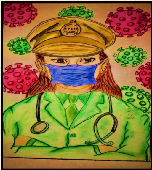
Modern Day Superhero- Doctor