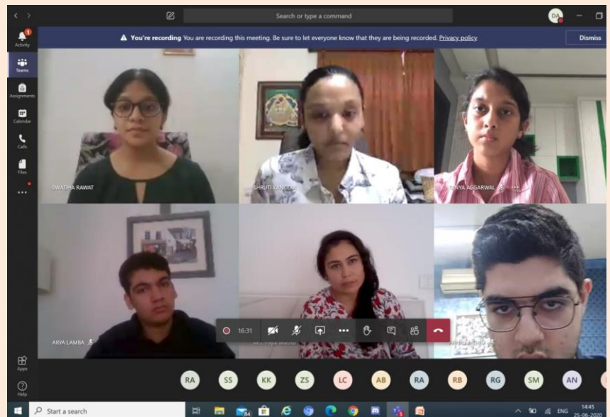
Students attending the Business Conclave online

This was an interesting activity where the participants enacted an advertisement to convince the consumers, with entertaining, engaging and gripping acts bringing out the features and benefits of the product.