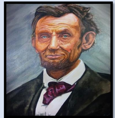
Award winning portrait of Abraham Lincoln