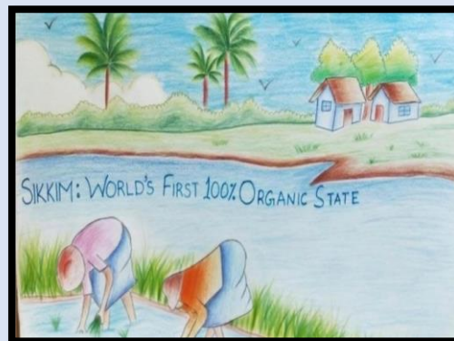
Aarish Jain (S2H)

Respect to whites , but not the blacks , With this discrimination, our hearts crack George Floyd , an innocent man , Mercilessly , he was crushed like a can . Then arose a protest , with the title ' BLACK LIVES MATTER ' , They fought as sharp as a cracker . from having peaceful protests to burning houses , their determination was like our armed forces . The world has been broken into two , respect and peace is only left in a few Now USA is crying , still protesters are trying . All this cruelty , all these wrong actions , has only and only led to destruction . Stop this discrimination , start love.