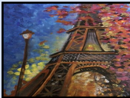
Mukund Beriwal (S3H)