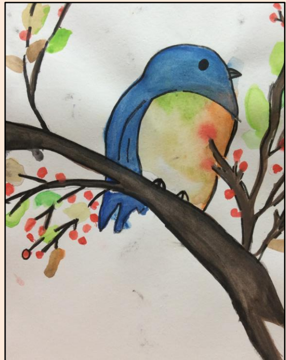
The Dynamic Bird

Happiness is a choice that we have to choose....so go for it!