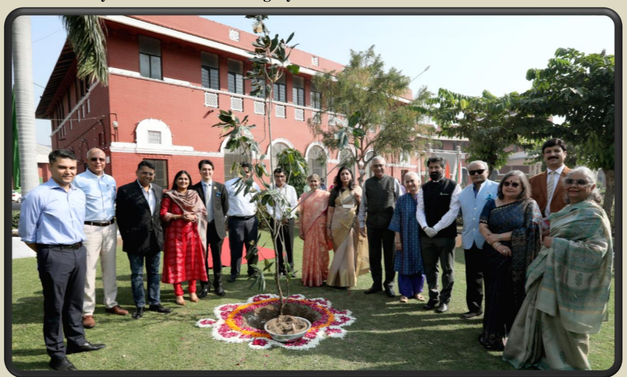
MODERN SCHOOL FRATERNITY AT THE PLANTATION CEREMONY OF THE SAPLING OF MAGNOLIA GRANDIFLORA

To create awareness for the Environmental conservation, exalting mother nature and celebrating the beautiful hues of nature, the Centenary Tree Plantation witnessed ecstatic participation of the Modern School fraternity. The sapling of the Magnolia grandiflora was planted on the occasion. For the coming years the tree will stand as a true testimony of Modern School's legacy.