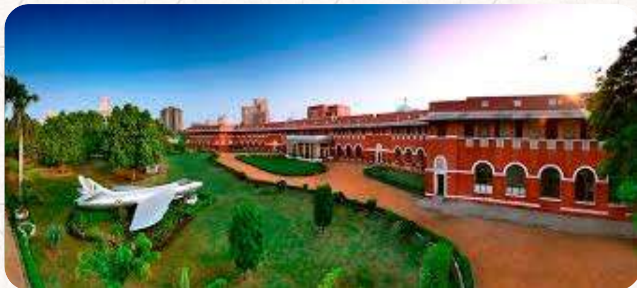
MODERN SCHOOL: A SERENE PICTURESQUE LEGACY OF A HUNDRED YEARS