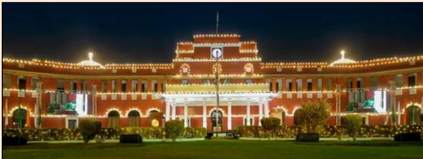
View of the Main Building Modern School from the Front Lawn