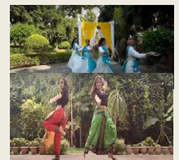
A Breathtaking mix of the Classical and the Contemporary

Evocative performances narrating the current plight of India’s holiest river, the pollution of Ganga, followed by short sequences as an advocacy for clean water. The visual stage reverberated in the high intensity of rhythm and melody as the dancers danced to some scintillating tunes and left the audience enthralled.