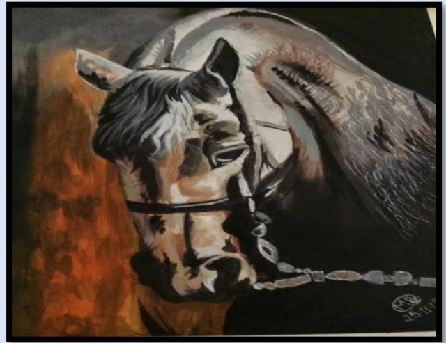
Painting by Mukund Beriwal (S3H)