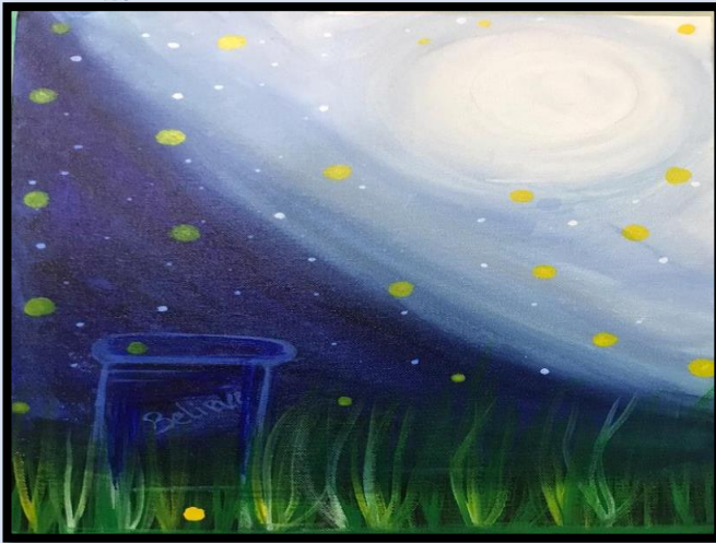
Painting by Dhruv Bagri (S2H)