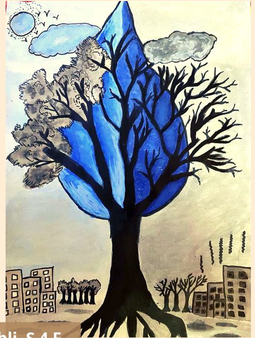
Paintings by Sneha Kohli S 4 F