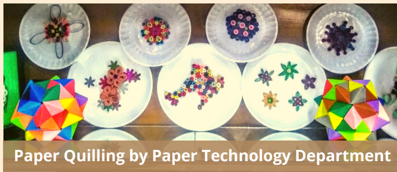
Paper Quilling by Paper Technology Department