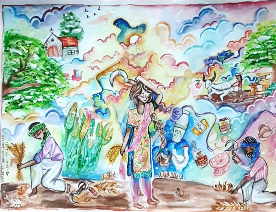
Painting by Laxmi Kaickei (S3E)