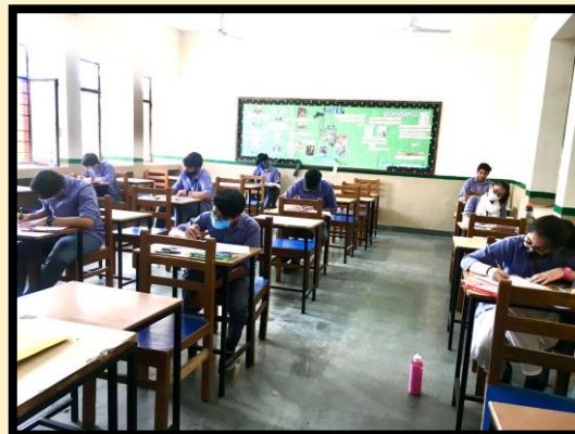
The students taking their exams

The second round of Pre-board examination for S5 and S7 commenced on Monday, 15 th March, 2021 and will continue till Thursday, the 22 nd April, 2021. These examinations are being conducted in the offline mode. The school is strictly following the COVID-19 protocol while conducting. The students taking their exams.