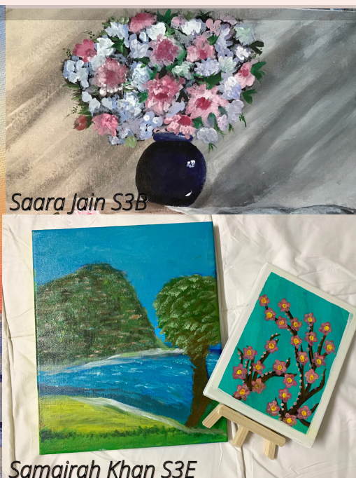
Saara Jain S3B