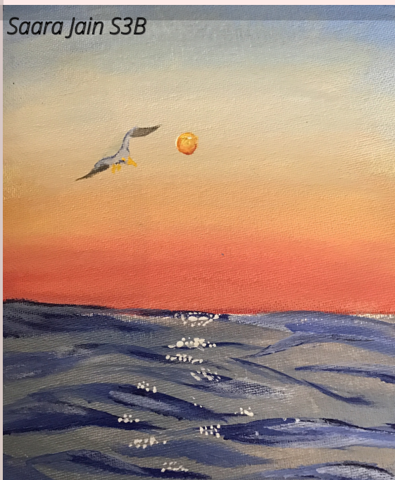
Saara Jain S3B