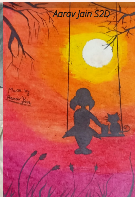
Aarav Jain S2D