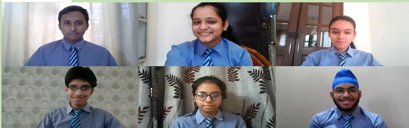
Screenshot from the online conference

"Together we can do so much." This quote from Helen Keller perhaps sums up the strength of the Round Square. The Round Square network encourages the member schools to co-ordinate on a wide range of collaborative programmes and activities that engage and develop students in practical ways. We are fortunate enough to be given this golden opportunity.