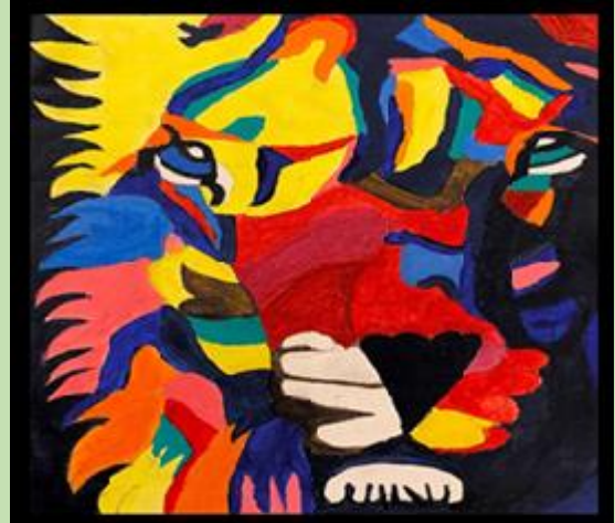
Pranay Suri S1C