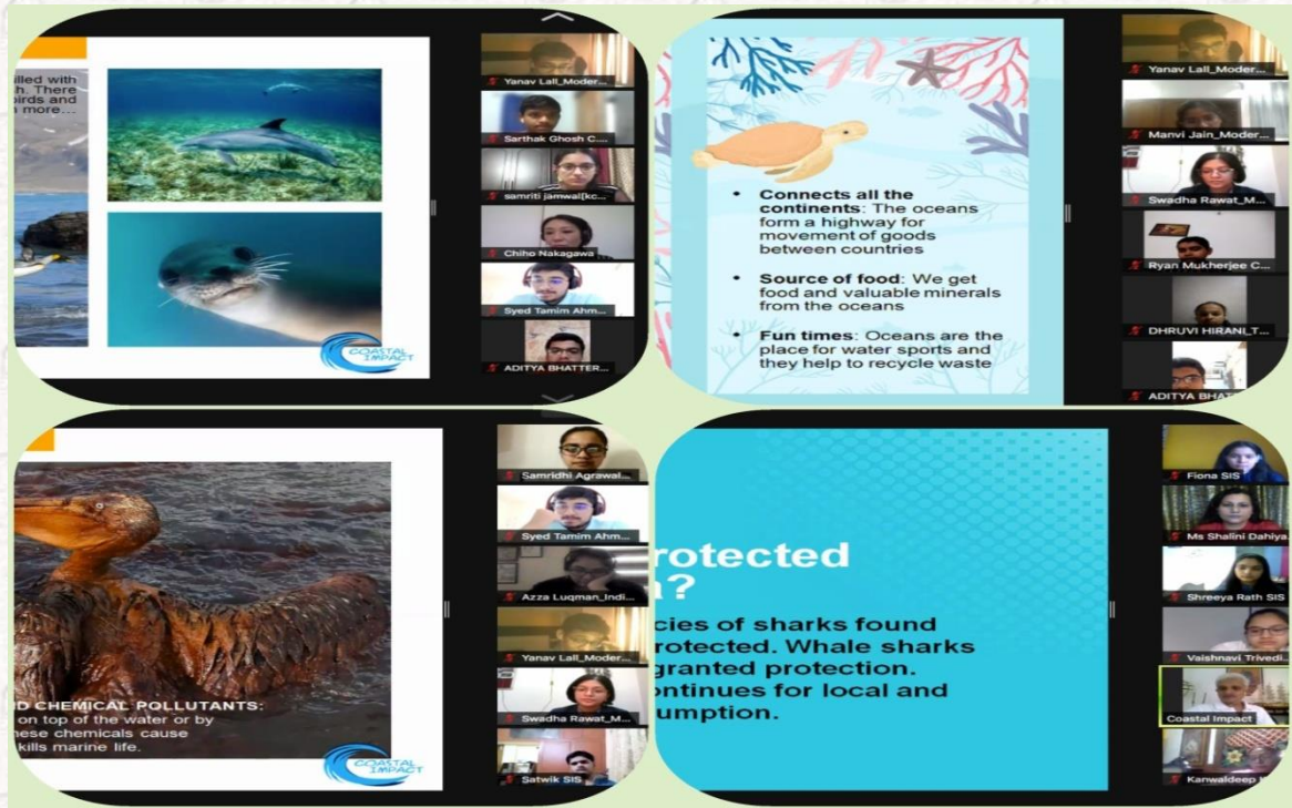
Screenshots from the Online Conference: 'Power Of One'