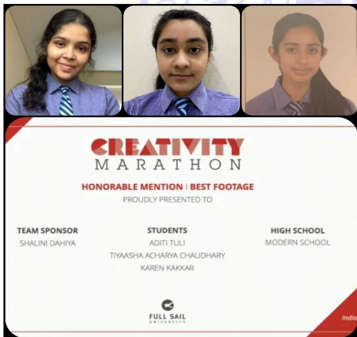
Honorable Mention of Modern School Students at the Competition

Creativity Marathon Contest, a filmmaking competition was organised by Full Sail University, Florida, USA where teams consisting of three to five students competed against other teams to produce a short video. The teams had to propose solutions to help achieve one or more of the goals presented in the United Nations' 2030 Agenda for Sustainable Development. After completing the registration process, participants had access to the Creativity Marathon platform and lessons provided by professionals in different aspects of filmmaking.