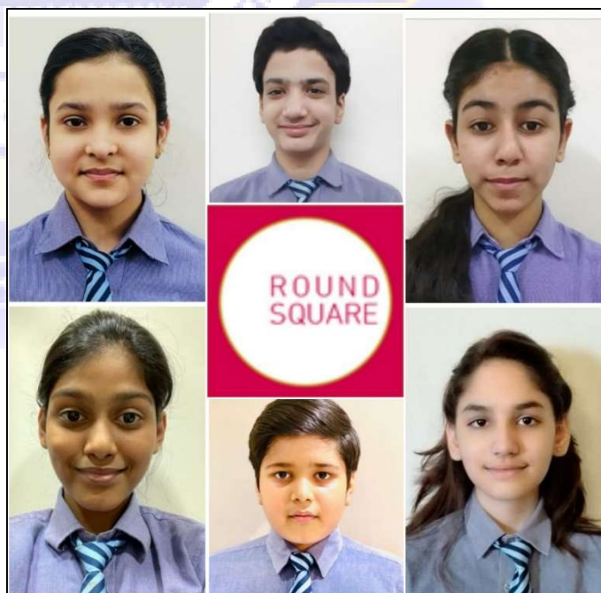
The Modern School Delegation

The students were given a pre-conference task for which they had to create a short video about self-expression, via various art forms. Due to the increasing need to express oneself during these tough times, it was the perfect pre-conference task for the delegates. On the first day, the students were addressed by the