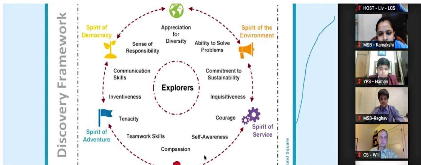
Students during a Discussion at the Event

The students identified and shared the twelve Round Square Discoveries namely inquisitiveness, tenacity, courage, compassion, inventiveness, ability to solve problems, self-awareness, sense of responsibility, appreciation of diversity, commitment to sustainability, communication, and team-working skills as their personal 'Signature Strengths' and which ones would they like to focus on for their personal growth. Thereafter, breakout rooms for Baraza discussions were created in which the students shared their heartwarming stories and experiences of their signature strengths. In the end, they talked about how a person can be a