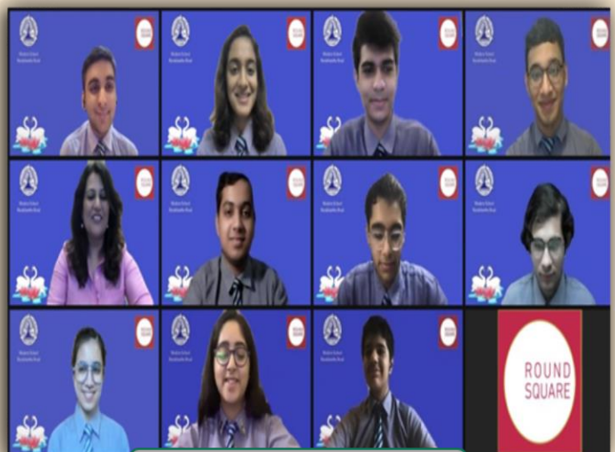
The Core Team

theme of the event - Courage Is Grace Under Pressure - which would keep the participants engaged throughout the conference. This included a series of videos and an online quiz. A set of questions, that was to be posed towards the delegates in the Baraza sessions, was also prepared. All these activities were directed towards changing the perception of courage from one which was deep-set in the minds of the participants to one