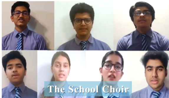
The School Choir