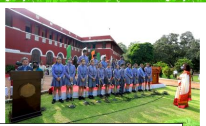
GLIMPSES OF THE CELEBRATIONS HELD IN SCHOOL.