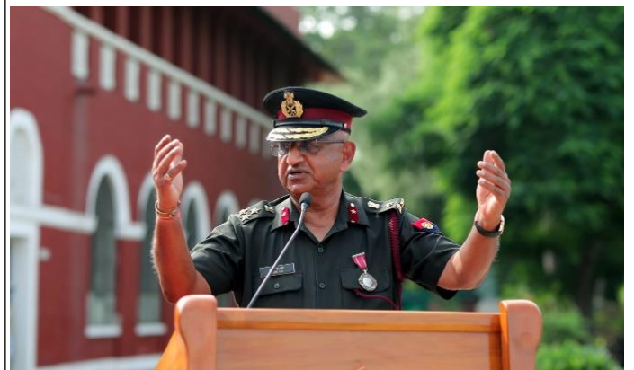
THE CHIEF GUEST, DR ARVIND LAL ADDRESSING THE GATHERING

The celebrations began with the hoisting of the Tricolour. The programme commenced with the Equestrian event, a splendid display by the members of the Equestrian Club. The various maneuvers showcased the perfect harmony between the rider and horse. The mellifluous songs sung in dulcet tones by the choir evoked patriotic fervor in the audience.