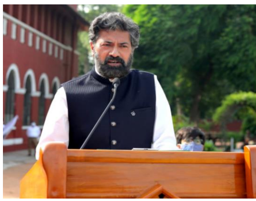
WORDS OF ENCOURAGEMENT THAT INSPIRE EACH MODERNITE