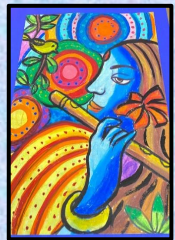
Labhya Aggarwal, S1-A