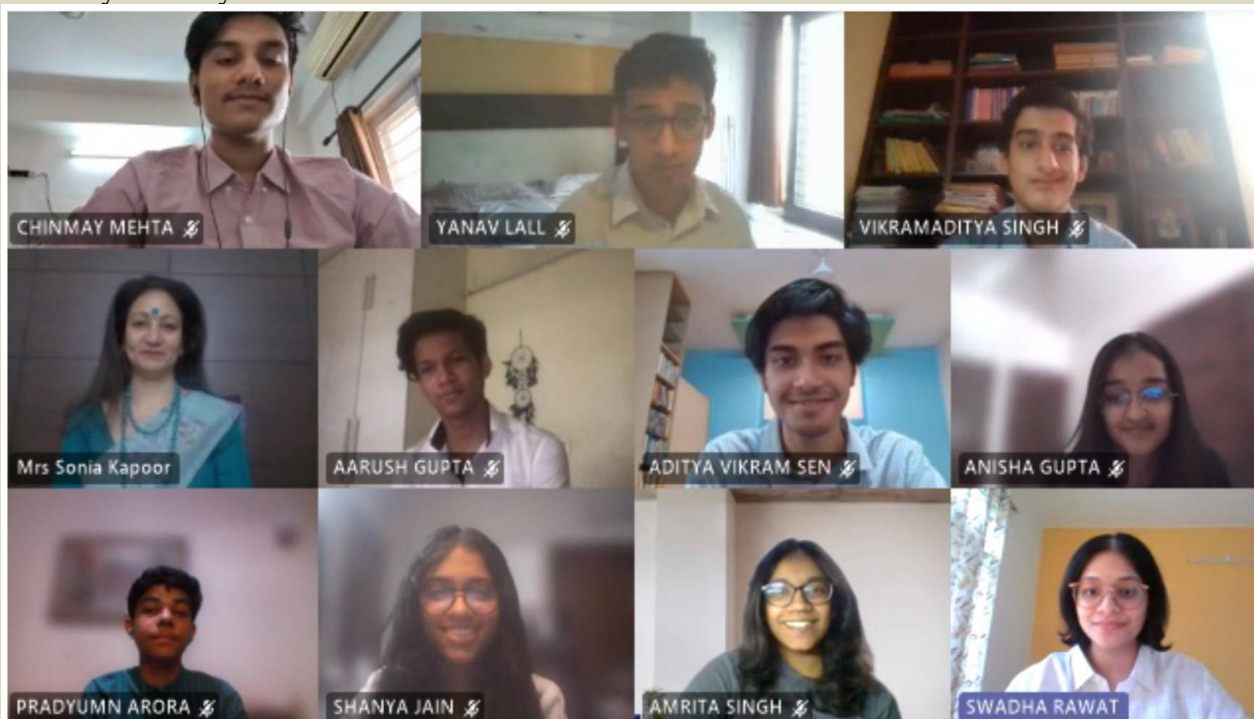
A Glimpse of MUN Society's Training Session

TRAINING SESSION: After having selected zealous students as new members of the society, the senior members of the society conducted a comprehensive online training session on 28 th , 29 th and 30 th June'21, which entailed explaining the fundamentals of the United Nations, along with the rules of procedure, research, debate and delegation for Model United Nations. To further broaden their horizon of knowledge, the MUN Society created a forum for a mock MUN simulation where each student assumed the role of a delegate, governed by the agenda "Discussing the Refugee Crisis". The efforts of the organising team came to fruition on 30 th June 2021, with sixty five budding leaders and diplomats being successfully added to the MUN Society for the year 2021-2022.