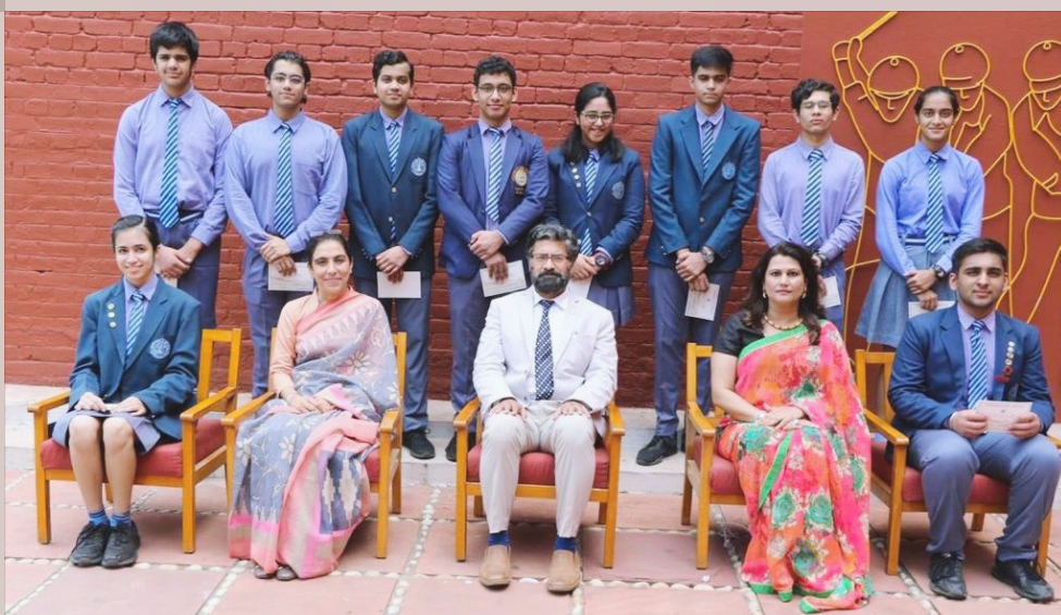
Glimpse from the Award Ceremony