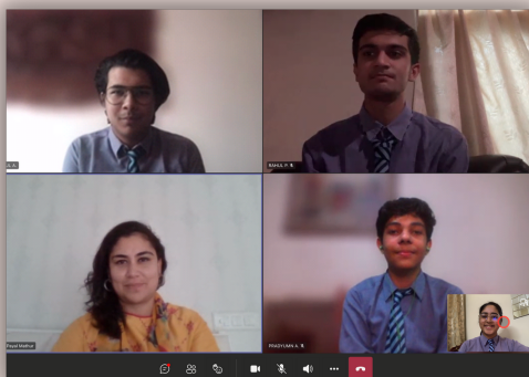
Screenshot from the online event.