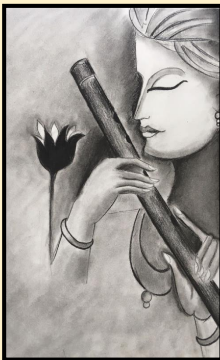
Gul Parmar (S4C)