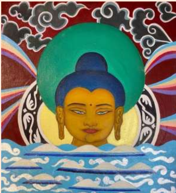
SURINA WADHWA S5E