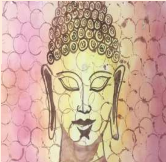
KARNIKA SEHGAL S7J