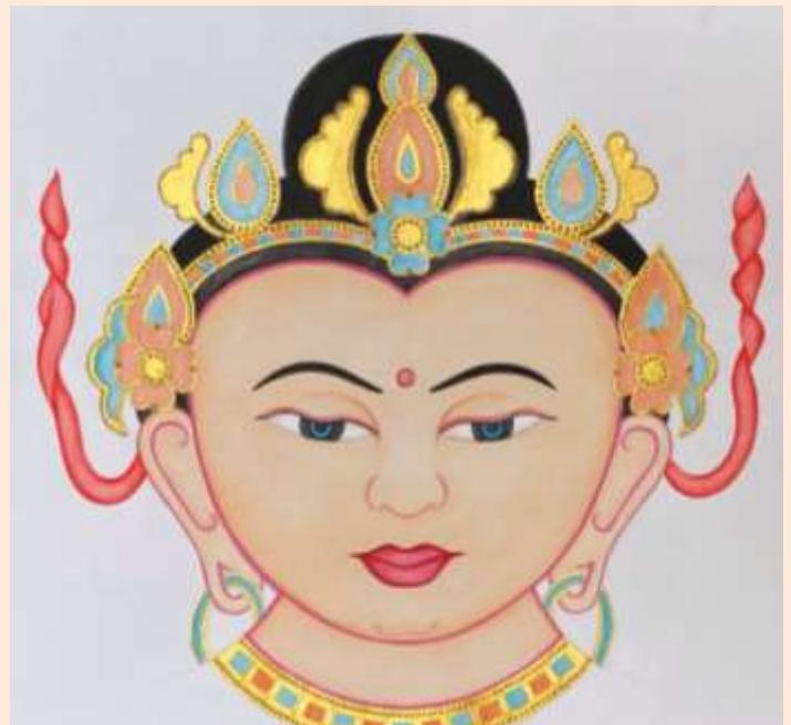
AASHNA BACKLIWAL S7E