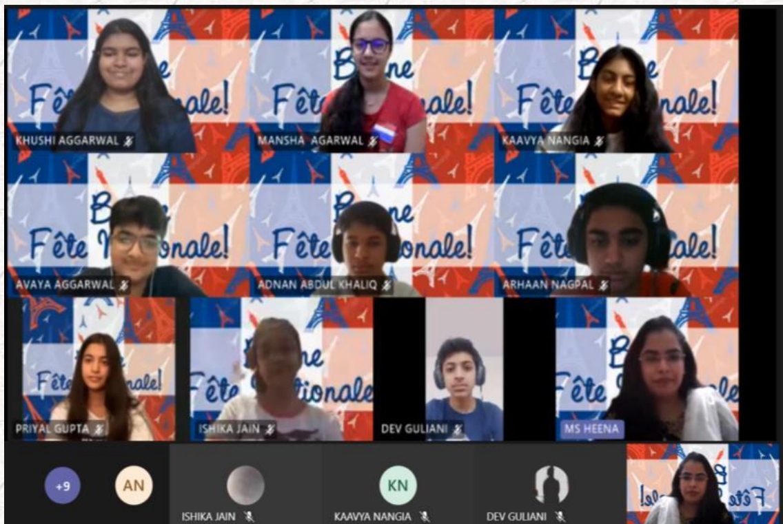
Enthusiastic participants during the Online French National Day Celebrations

La Fête Nationale (French National day) was celebrated in school during the French period virtually. Students from classes S1 to S5 enthusiastically took part in the celebrations. They were dressed in the colours of French Flag i.e. Blue, White and Red. Some of them painted their face with the colours of French Flag and some wore badges of the French Flag. Various activities were organised to celebrate this special day. A presentation was shown showcasing the significance of this day. The Middle School students prepared bookmarks and posters on the topic 'Qu'est ce que c'est la France d'après vous?' Participants from Classes S3 and S4 sang a well synchronised melodious French song. Also, a small skit was presented Class S4. Quiz was conducted for Class S5.