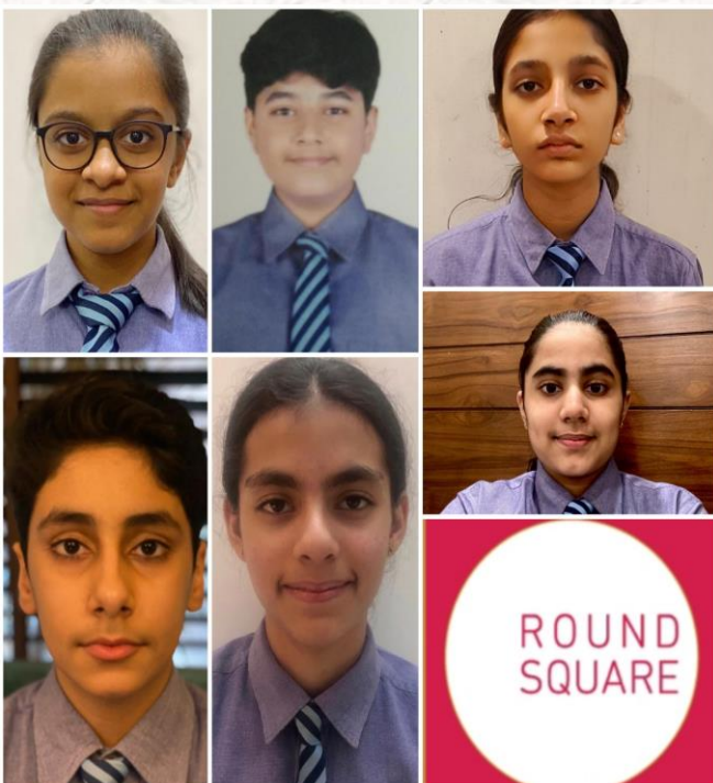
Delegates at the Round Square Conference

This conference was an enriching experience for all.