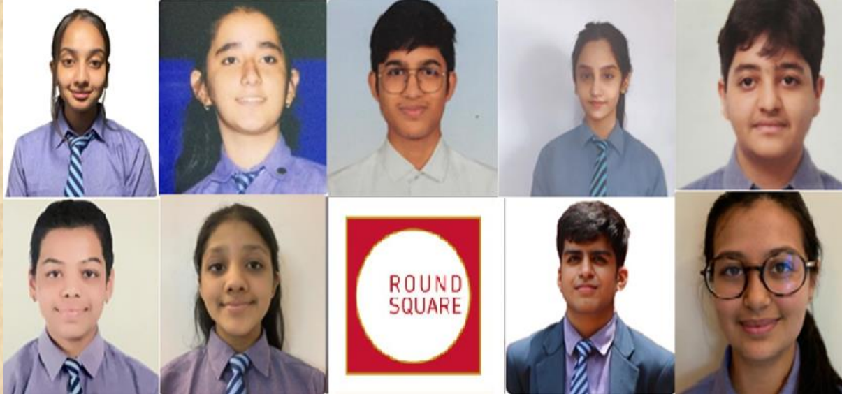
Screenshot from the online conference