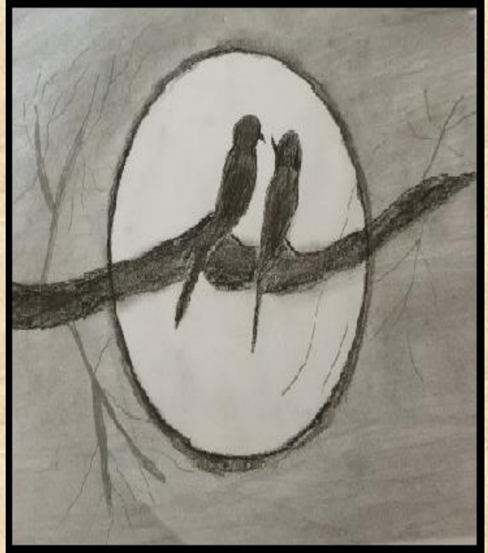
Drawings by- Karnav Gupta (S1C)