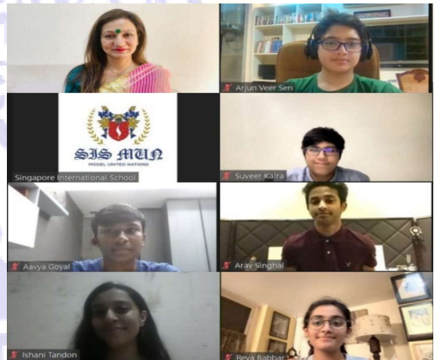
The Modern School Delegation

Amid fierce competition, Modern School stood out in the crowd, showcasing exceptional research and extraordinary efforts. In this prestigious and highly competitive All-India MUN, the following participants secured awards in various committees: