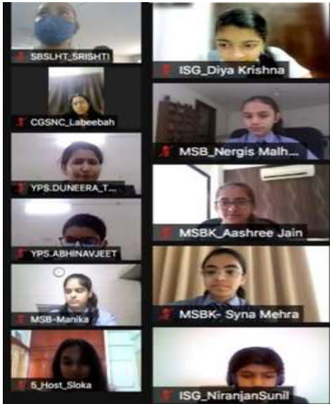
Students at the Conference