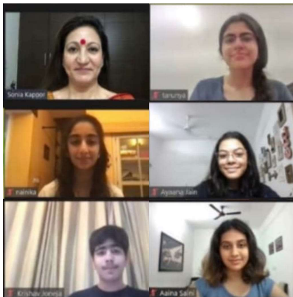
The Modern School Delegation