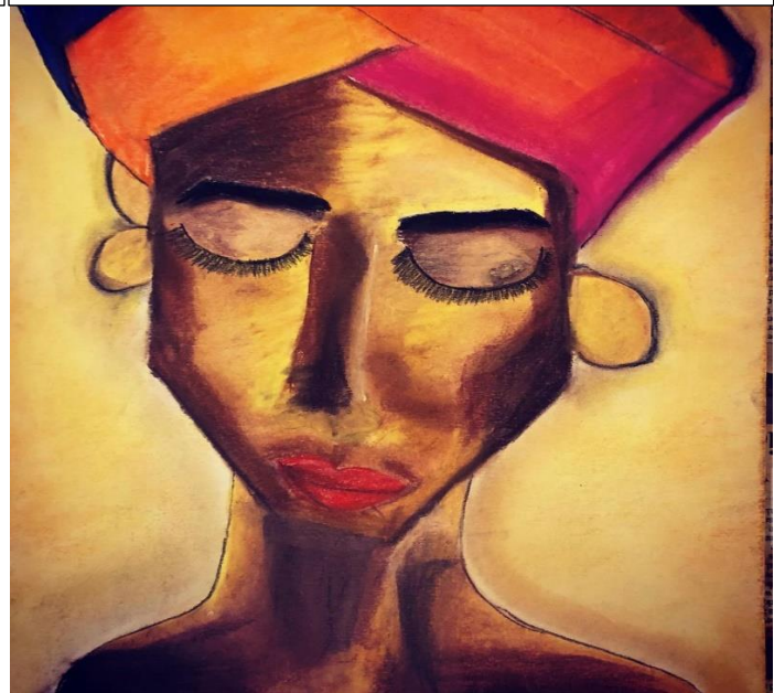
'CONTEMPLATION' BY JAHNAVI BAHUGUNA, S3 C