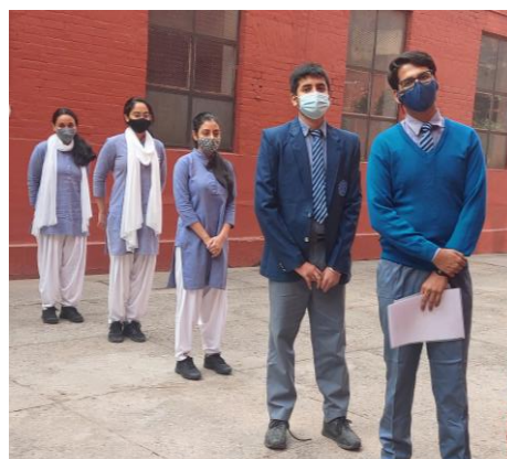
STUDENTS WAITING TO ENTER THE EXAMINATION HALL

Students of class X and XII received their admit cards for the Term I CBSE Board Examination to be held in November and December 2021. The distribution was conducted in a phased manner, keeping the COVID guidelines and students’ safety in utmost consideration. Students of Class XII also gave their Board Practical examinations online due to the suspension of offline classes, as a result of the deteriorating air quality in the Capital.