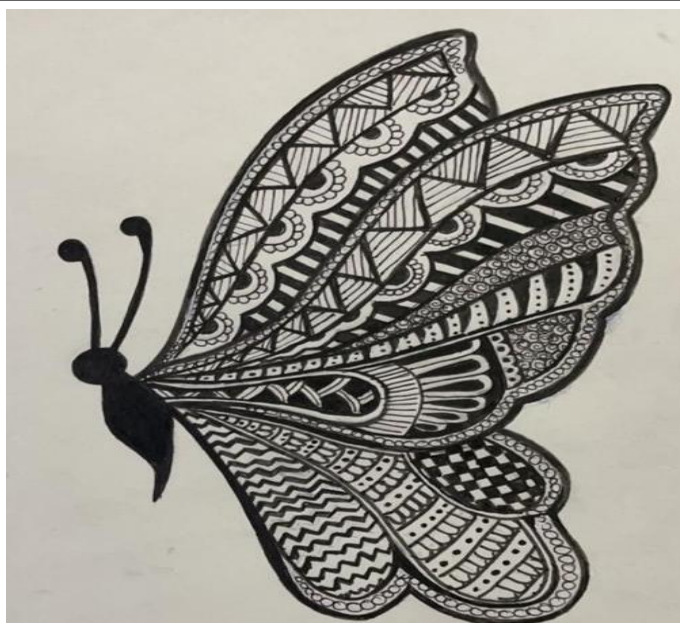
'GIVING WINGS TO IMAGINATION' BY SHALEEN SHIV, S4 C