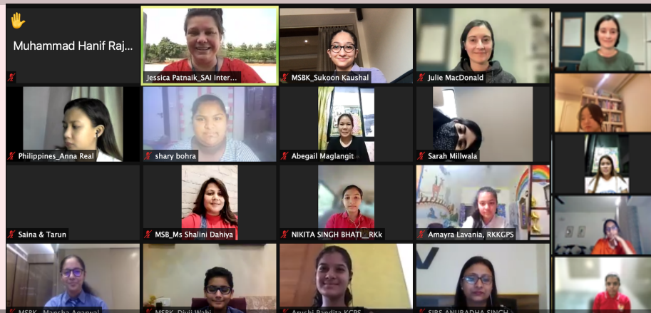
Glimpse from the online event.1