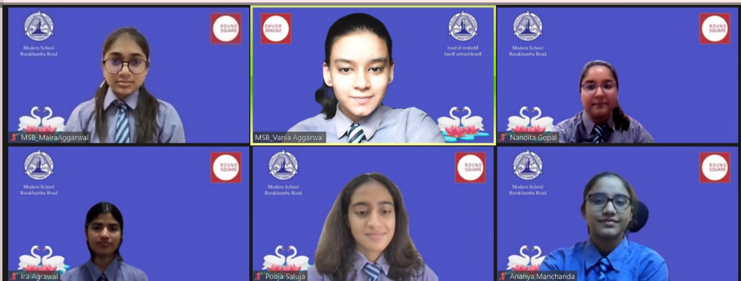
Glimpses from the Women in Games Round Square Postcard event.