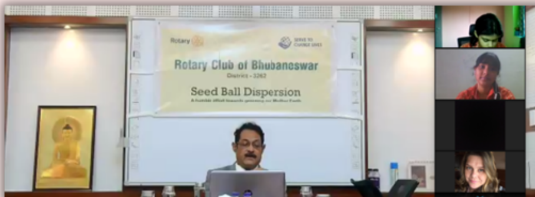
Screenshot from the online event.

On 28th October, the event started with an introduction, followed by a presentation from the Eco-club 'Planeteers' of the host school, on the topic 'Carbon Footprints Reduction- Ten simple lifestyle changes'. In this event, the delegates got a detailed explanation on the importance of trees in our life and also emphasized the urge to not just protect but plant them. The delegates all were also introduced to innumerable ways of contributing in this much required initiative.