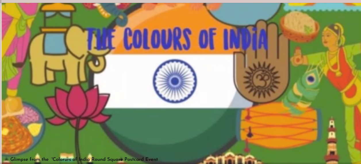
Glimpse from the 'Colours of India Round Square Postcard Event'