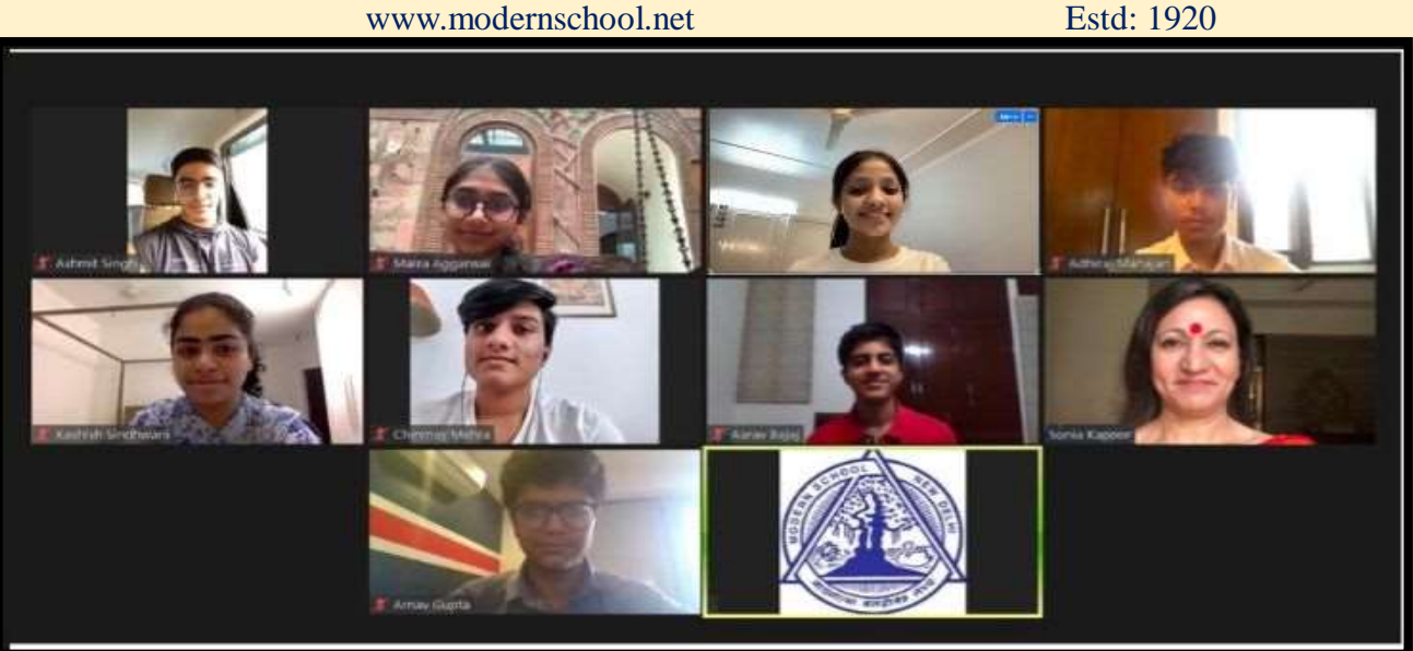
The enthusiastic delegates of the Conference