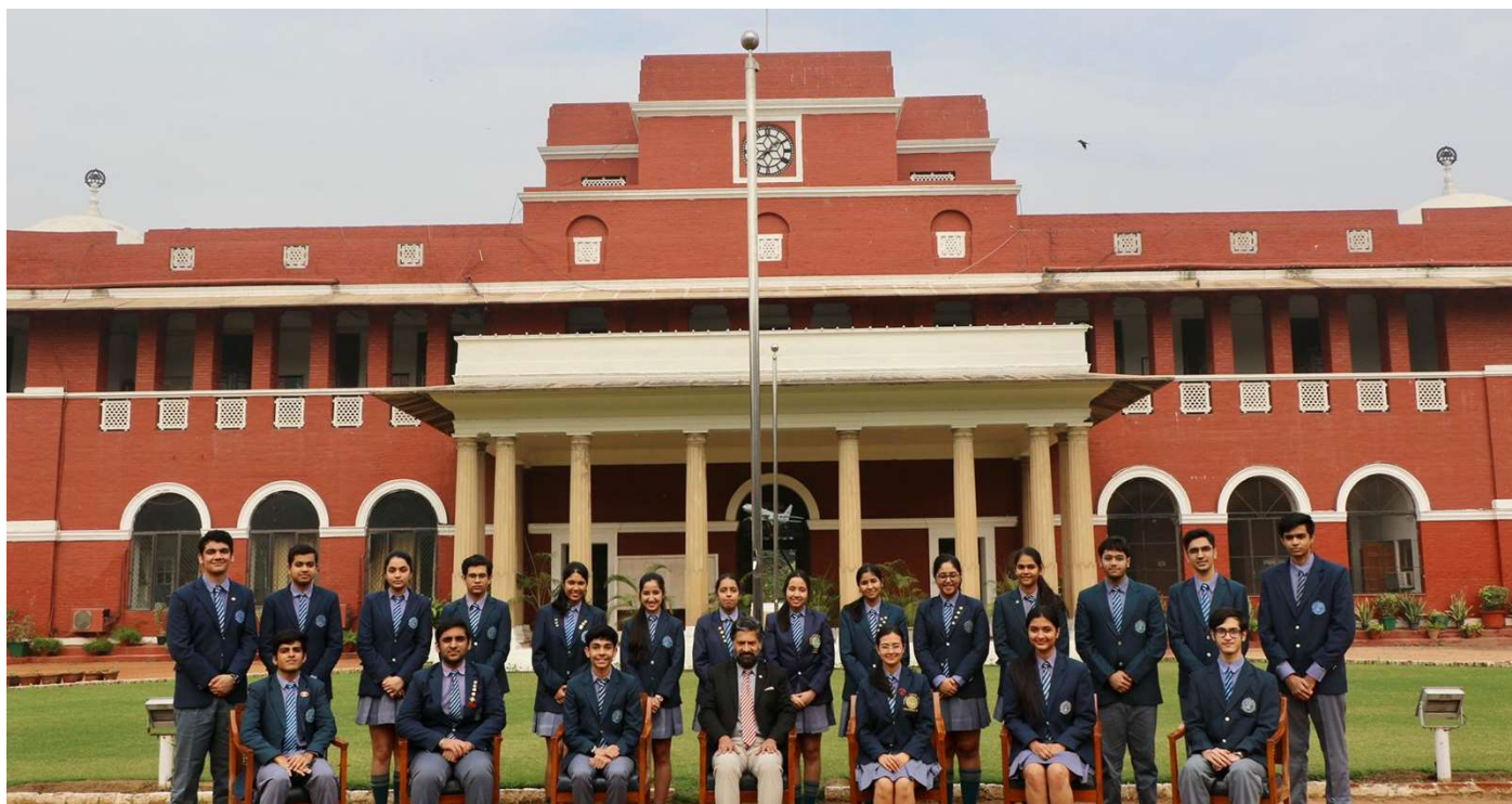
PREFECT Badge Ceremony 2021-2022