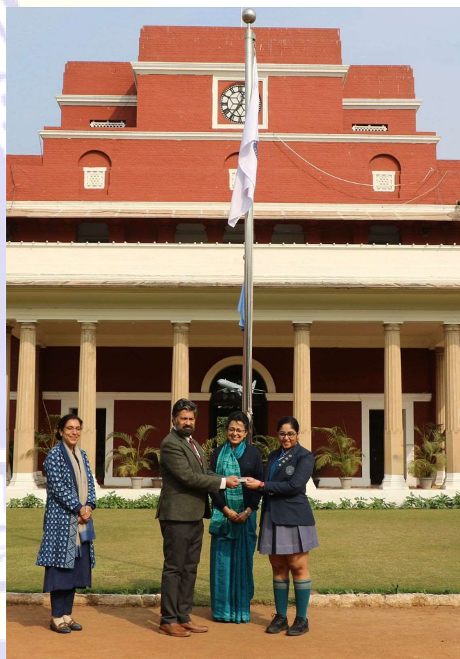
Students receiving the Prefect Badge at the ceremony