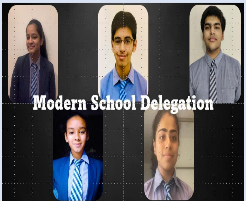
Modern School Delegation attending the Conference

Organised to understand the significance of democracy in current scenario, the conference provided an environment where the delegates could freely talk and develop a critical viewpoint about political situation of their own countries on a global platform.