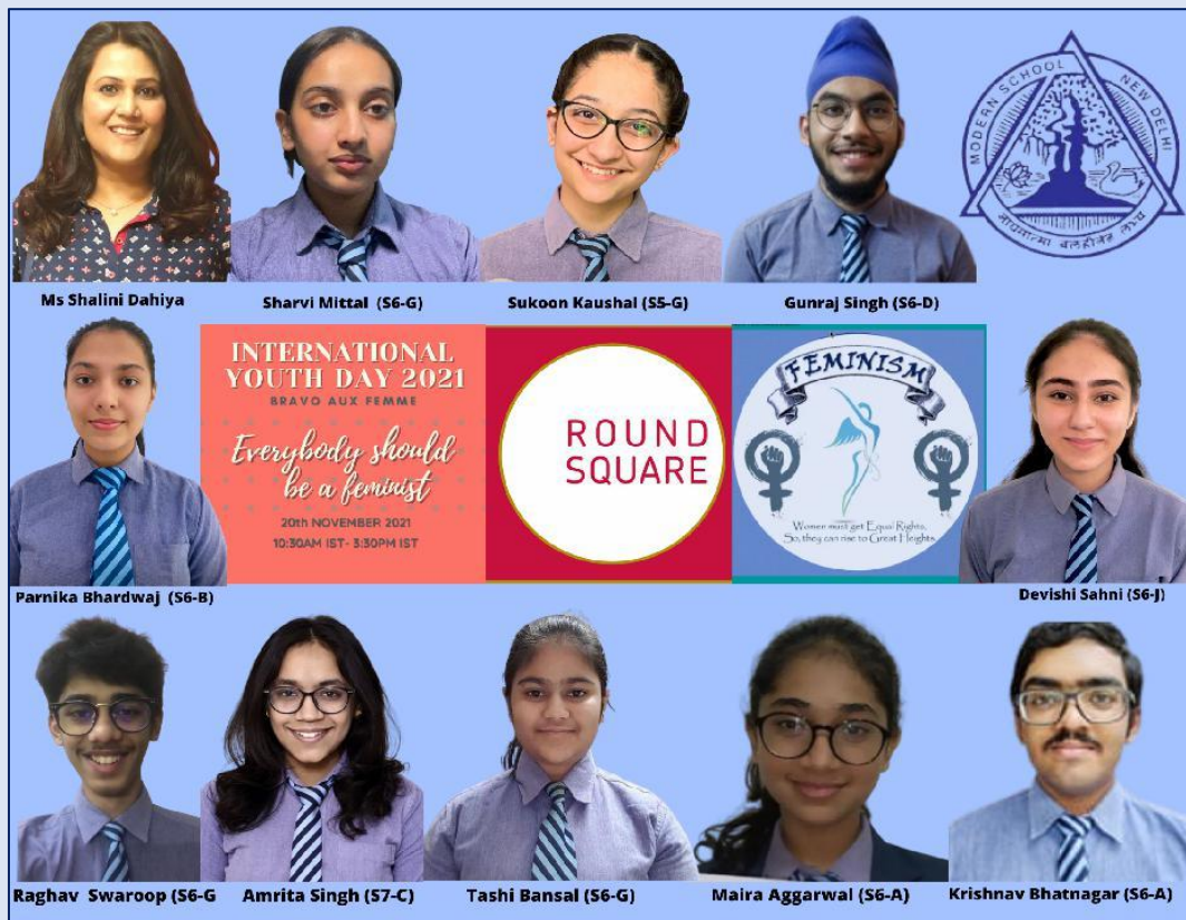
Student participants during the Round Square Conference

This year it was held on virtual platform on 20 th November, 2021, in collaboration with Junior and Senior High School of Kogakuin University, Japan. This year's topic of discussion was 'Feminism'. The entire event focused on teaching the correct meaning of this term and ways to combat any sort of discrimination against women. Incidences from everyday life were discussed during the Conference, which proved to be eye-opener for the participants about this social evil.