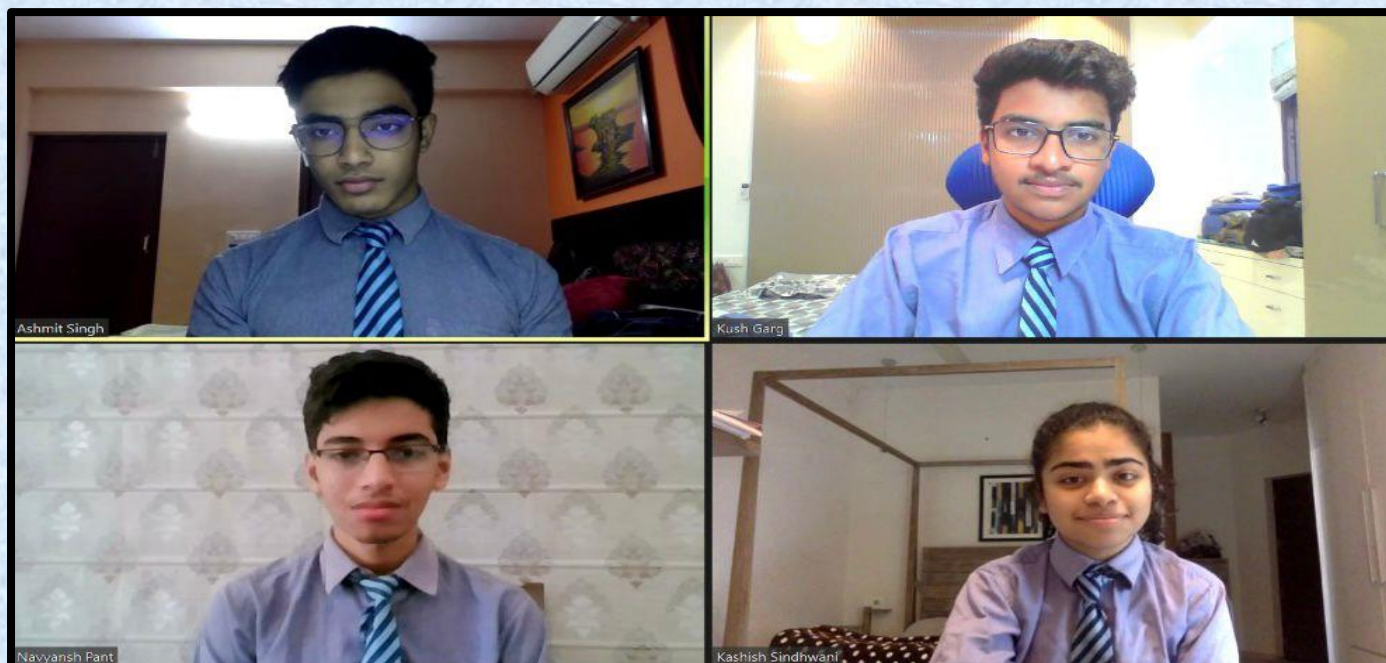
Screenshot of the participants during the Event