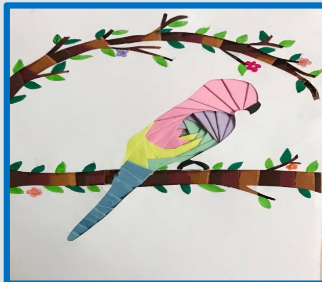
Aahana Backliwal, S1C