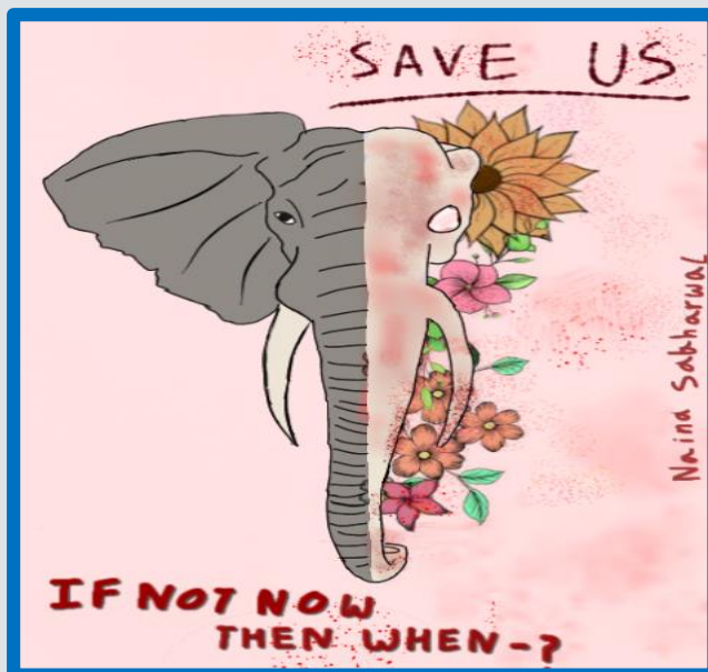
Naina Sabharwal, S1C