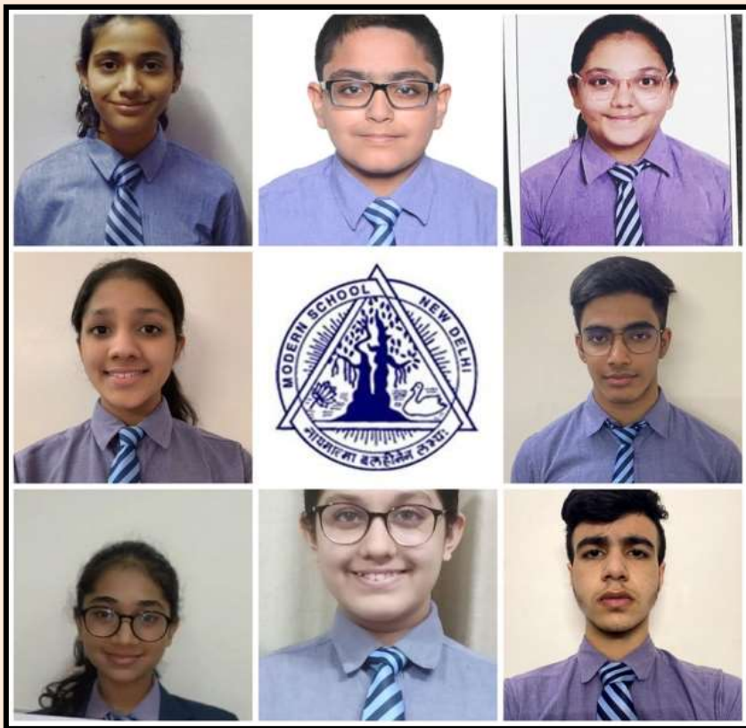
Participants of the SAI International Global Debate

Congratulations to all the participants.