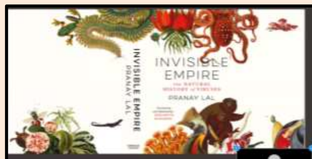
Glimpses from the Webinar